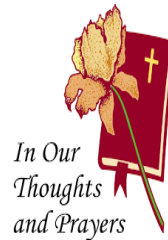
In Our Thoughts and Prayers