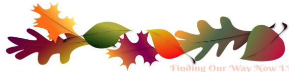
Finding Our Way Now LLC