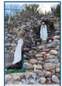
The Eucharist bathes the tormented soul in light and love. Then the soul appreciates these words, 'Come all you who are sick, I will restore your health.' St. Bernadette Soubirous