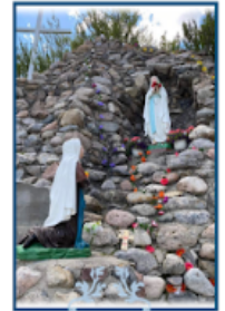
The Eucharist bathes the tormented soul light and love. Then the soul appreciates the words, "Come all you who are sick, I will restore your health."